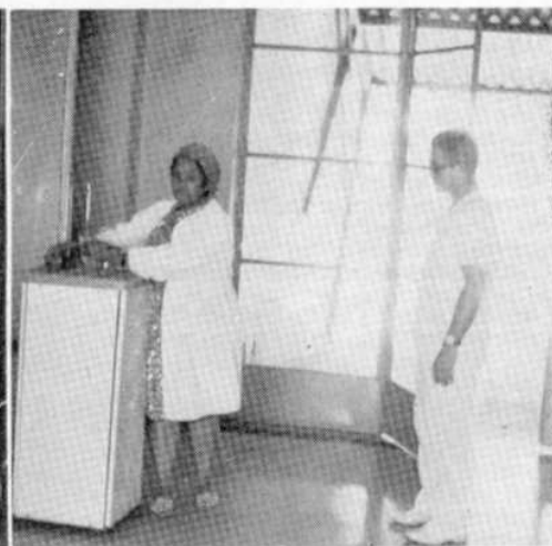
Relative positions as water bottle was filled