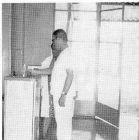
Filling the mug