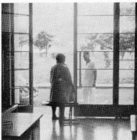
How the "visitor" arrived—scene reenacted